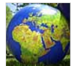
40 green tips