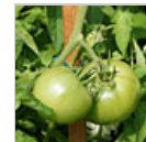
Readers' veggie photos