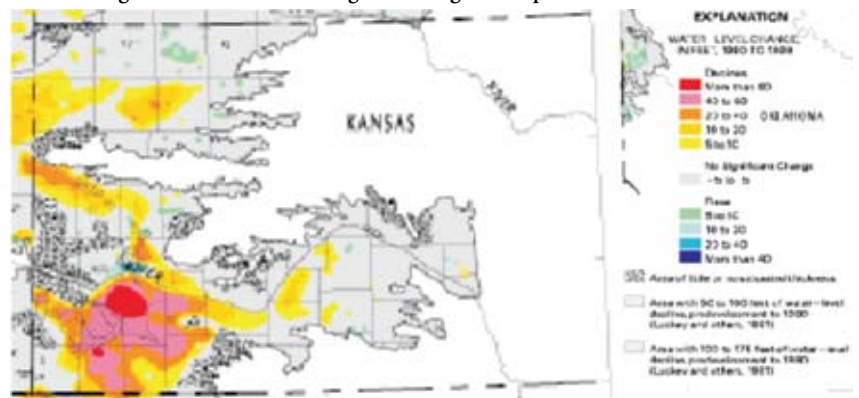
Figure 1. Water Level Change in the Ogallala Aquifer in Feet, 1980-1999

A drier and warmer climate in western Kansas will elevate tension among water rights holders. 7 Conflict already has arisen between Kansas and its neighbors over water: Colorado paid Kansas $29 million in damages for taking too much water